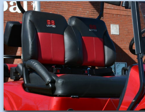
Plush two-tone seats