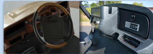
Wood grain or carbon fiber treatment