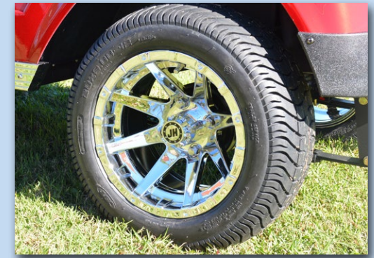
Dura Chrome Rims