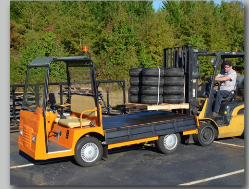
2,200 cargo load capacity