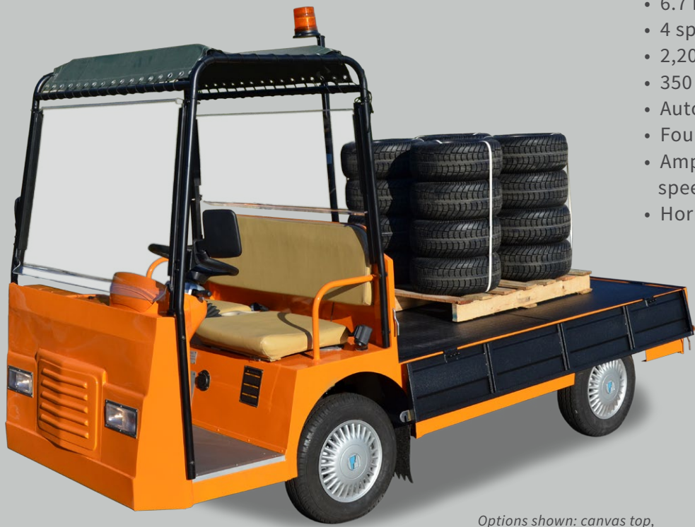
Options shown: canvas top, and amber strobe light

Our growing line of commercial-grade, electric vehicles gets the job done. From hauling to towing to recycling, we have the plug-in utility vehicles to meet all your industrial and commercial needs. When you've got a burden to carry, this is your truck. The U-Series is built to tow, haul, carry, and perform.