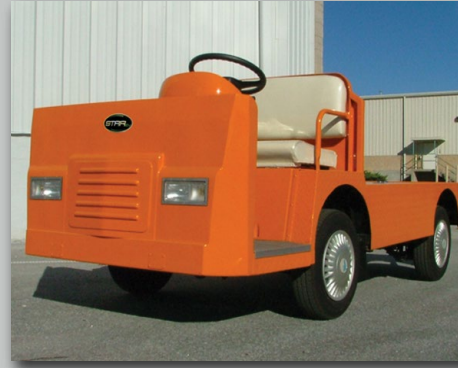
Flat bed, open cab option