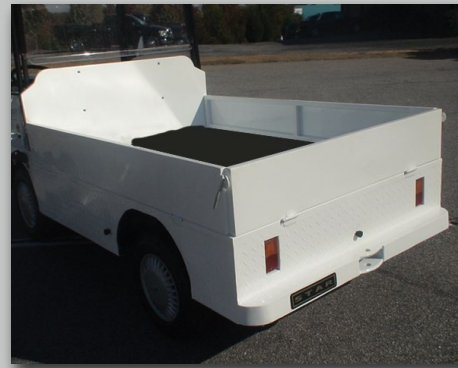
Standard heavy duty undercoating and bedliner