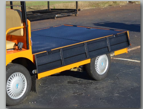
Fold-down bed box sides