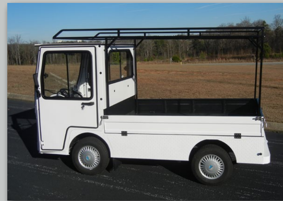
Optional ladder rack