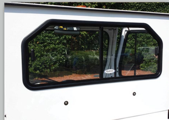
Large sliding back window for maximum visibility and ventilation