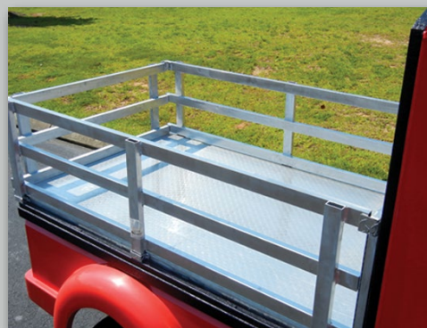
19" high stake backs to hold any equipment