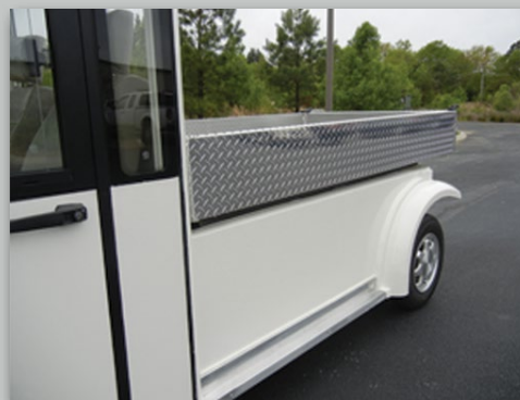
Fold-down tail gate; optional fold-down side rails