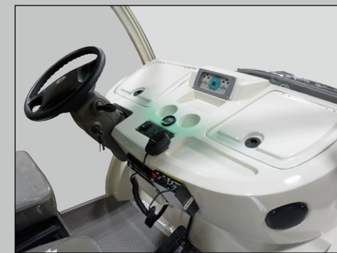
Front dash, roomy interior