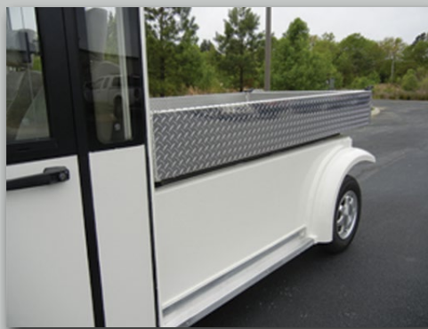
Fold-down tail gate; optional fold-down side rails