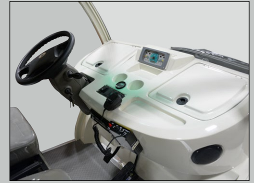
Front dash, roomy interior