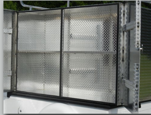
Locking, enclosed box with custom shelving