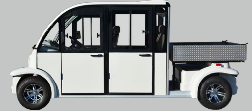
AK48-4-UB(-D): Utility Box