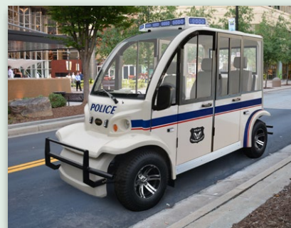
Security vehicle option (AP48-04-D-Police shown)