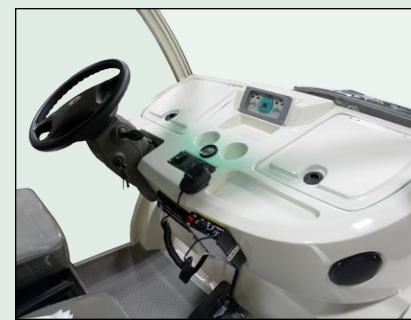
Front dashboard with detailed analog display