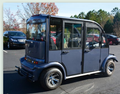
Large rear window for maximum visibility (Custom color shown)