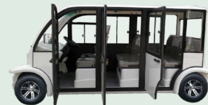
Aluminum and glass doors (AP48-06-D shown)