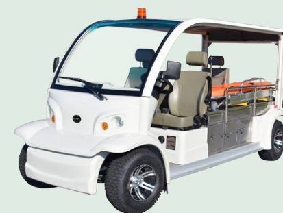
Ambulance vehicle option (AP48-04-Ambulance shown)