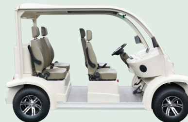
Open seating area with adjustable arm rests and seat backs (AP48-04 shown)