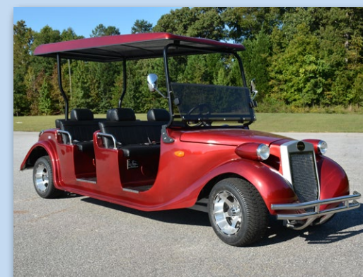
Also available as a 6 passenger: Roadster 4+2-AC