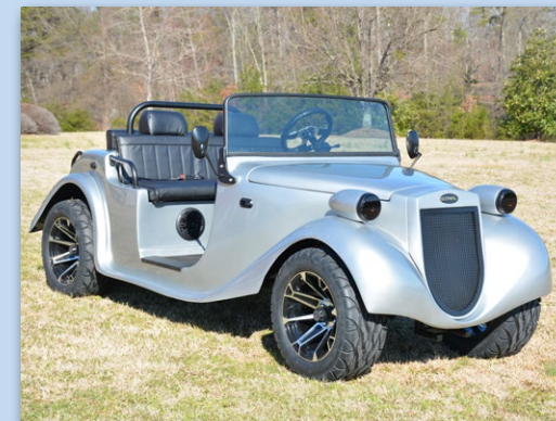
Classic, retro style (custom model shown)