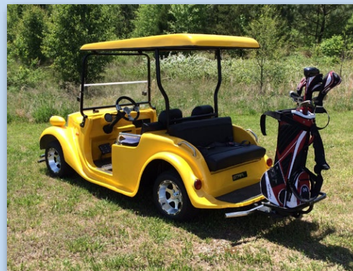
Optional roof and golf bag holder attachment